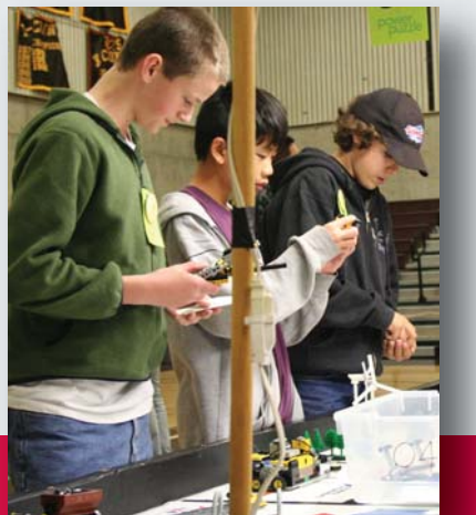
WGMS Robotics Team BotBall, Spring '08

Donors who contribute over $500 per year, receive a newly minted Donor Pin.