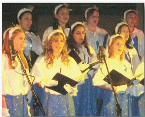
WGHS's Advanced Treble Clef Choir at the Willow Glen Christmas Tree Lighting

NON-PROFIT ORG U.S. POSTAGE PAID PERMIT 357 SAN JOSE, CA