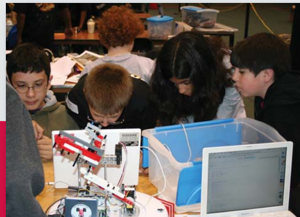
WGMS Robotics Team BotBall, Spring '08