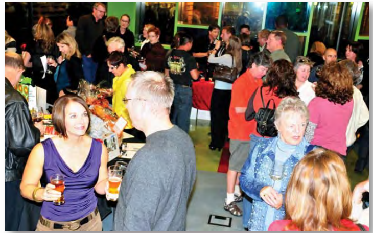
Over 300 people enjoyed an afternoon sampling delicious food, wine, and beer at the Foundation's 2014 Tasting Event.

'14 Tasting Event Membership Corporate Giving Individual Giving SVGives Campaign