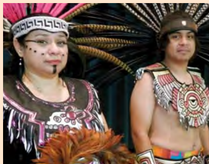
7th grade Social Studies students were treated to a visit from San Jose's awarding winning Tezkatlipoka Aztec Dance & Drum group.