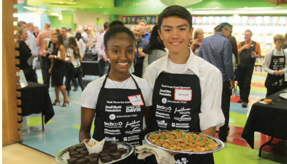
Student volunteers served up delicious appetizers to 350 guests at the 2018 Tasting.