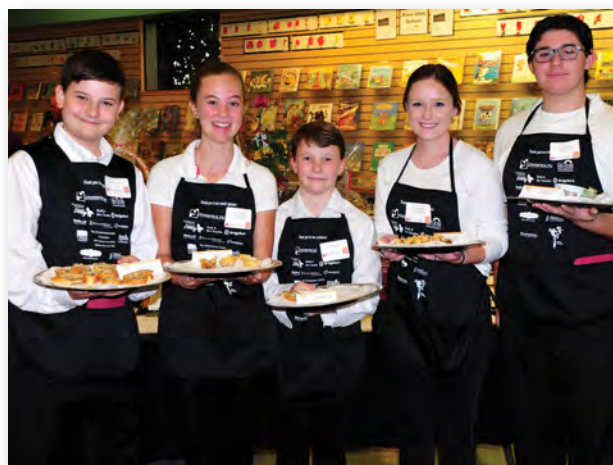
Student volunteers served up delicious appetizers to 350 guests at the Foundation's 2015 Tasting event.

Our apologies for any inadvertent errors or omissions.